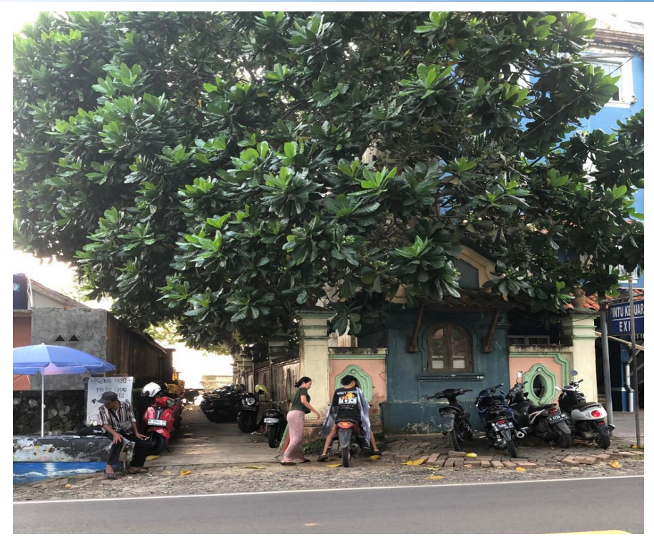
Figure 3. illegal entry access managed by residents

Coser (2018), also explained that conflict can have functional and dysfunctional impacts on the relationships between structures that exist in the social system as a whole. The conflict that occurs in the management of tourist destinations here is a realistic conflict, this conflict arises from dissatisfaction with specific expectations in the relationship and from estimates of the benefits obtained by the perpetrator. In this case, the community wants survival in terms of tourism in their village but is hampered by the conflict that occurred with the developer, where the government is unable to resolve this conflict.