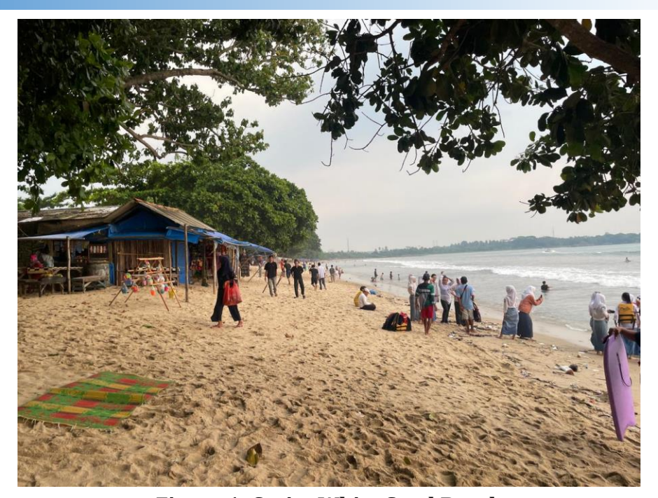
Figure 1. Carita White Sand Beach

In Pandeglang Regency, tourism development is carried out based on regulations and medium-term development plans for the Pandeglang Regency area. In fact, specifically, tourism is one of the Pandeglang Regency government programs which is mandated by the Pandeglang Regency Tourism Office in the context of developing tourism destinations and infrastructure in Pandeglang Regency (Ihwan, 2020). Pandeglang Regency tourism includes access to 5 (five) strategic superior areas (KSPN) or what are currently known as Special Economic Zones (KEK) which were built by the central government to increase productivity in the tourism sector so that it can become one of the sectors capable of increasing foreign exchange for the country. and open employment opportunities (Wendy, 2017).