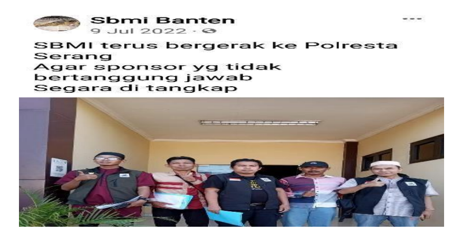
Figure II. SBMI Banten Assisting Muninggar Victim Case

After getting an employer to work as a housemaid, the victim suffered a bad fate, because in this job there were indications of exploitation of time and energy at work which resulted in negligence at work. The fire that the victim experienced while doing her work killed her sleeping employer and this fire resulted in the victim being imprisoned in the Dubai police, and threatened with a fine of around 200 dirhams. This problem was reported by the victim to her family with the aim of asking for help to be released from punishment for her case. According to the victim's family, namely the victim's husband who tried to ask for help from several parties, "I first reported initially to the sponsor but because there was no movement, then I tried to report to SBMI Banten and was immediately responded to and actually processed".